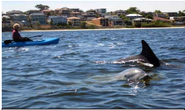
Kayaking with friends, and dolphins on the Swan River near home

Ongoing sport activities year-round in the wonderful Perth climate include yoga, swimming, running, bicycling, kayaking, playing Frisbee, long walks, hikes and gardening. There is always something to do!