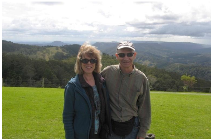
Southwest of Brisbane in the Great Dividing Range