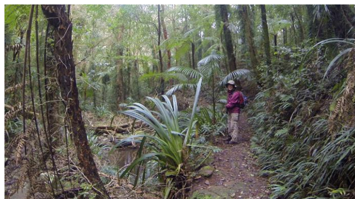
Cathie in the subtropical forest, on "The Great Walk" trail

Local people, and new friends we met at the Rain Forest Retreat at dinner, told us while hiking, to be on the lookout for leeches dropping into your hair from trees overhead, ticks, poisonous snakes, ancient poisonous spiders, lizards and stinging neurotoxin