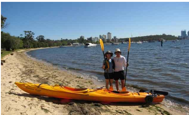
A Saturday morning on the Swan River