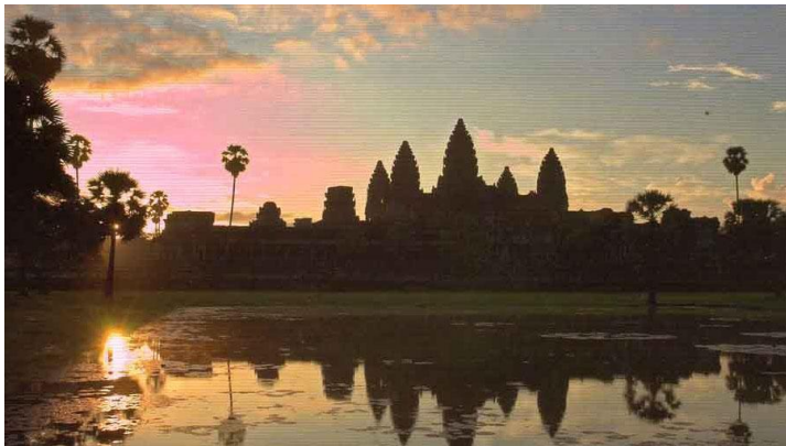
A post card sunrise view of Angkor Wat

The sunrise over the world famous temple, Angkor Wat was magical! It is the best known of dozens of temples built in the region with the aid of elephants