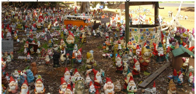
Some of the gnomes at Gnomesville, Western Australia

A goal of the trip, which we satisfied, was to place a "Mates on Bikes" gnome statue in Gnomesville, an iconic Australian site near Wellington Mill. To remember the trip, we made a 30 minute video, which had rave reviews among a select audience of gnomes.